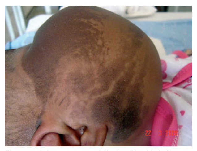
Figure 2. Sebaceous nevus following Blaschko's lines on the right side of the face.

waxy in some areas and pebbly in others, following Blaschko lines on the right side of his face (Fig. 2). A neurologic examination was normal except for a mild head lag. He had bilateral optic atrophy. Cranial computerized tomography scan revealed